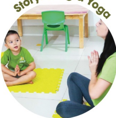
Storytelling & Yoga